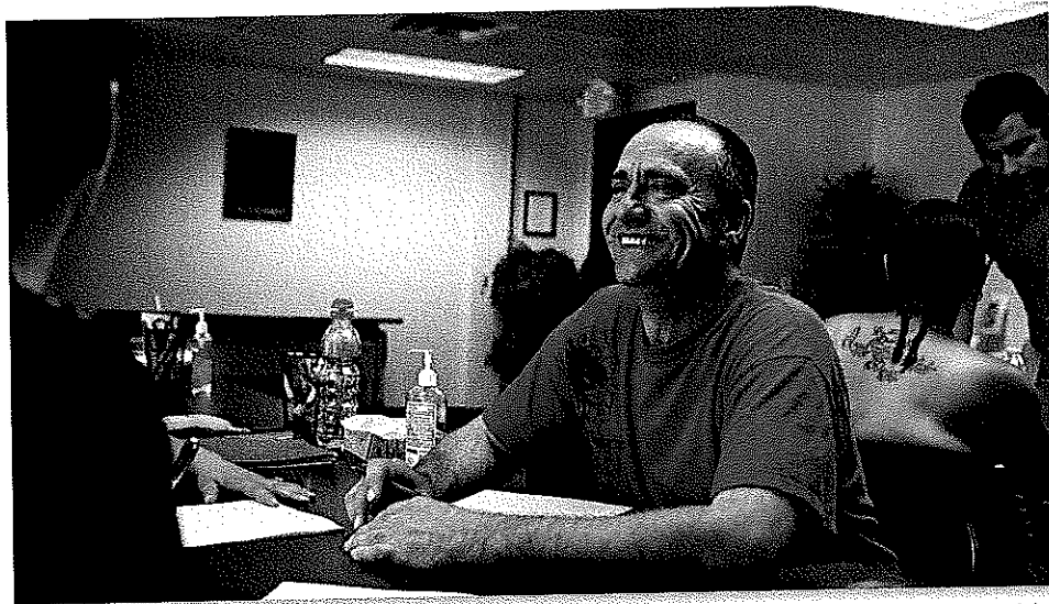
Goodwill's Prisoner Re-Entry program provides services to individuals to help them transition into a successful and productive life after incarceration.

Reconnecting with the labor force can be challenging for anyone. Add a criminal history to the scenario and it can seem impossible. At Goodwill, individuals with a criminal history, who want to work, are assisted with preparing to go to work and maintaining regular employment. The program provides a road map for participants to achieve a long-term goal of remaining attached to the legitimate workforce and maintaining their freedom.