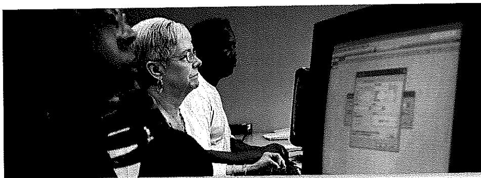
Goodwill's TANF Support Services for individuals focuses on the employment ability and other services to assist participants.

Virginia's TANF program emphasizes personal responsibility. Participants may be provided with services such as job skills training, work experience, job readiness training, child care assistance, transportation, and other work related expenses.